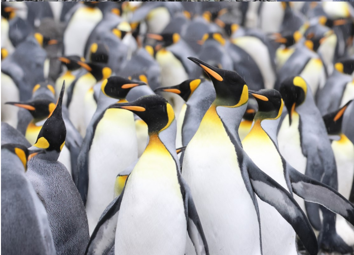
The King Penguin ( above and right ) along with the endemic Royal Penguin ( below ) are the dominant species on the island, where they gather in colonies and breed in the tens of thousands.