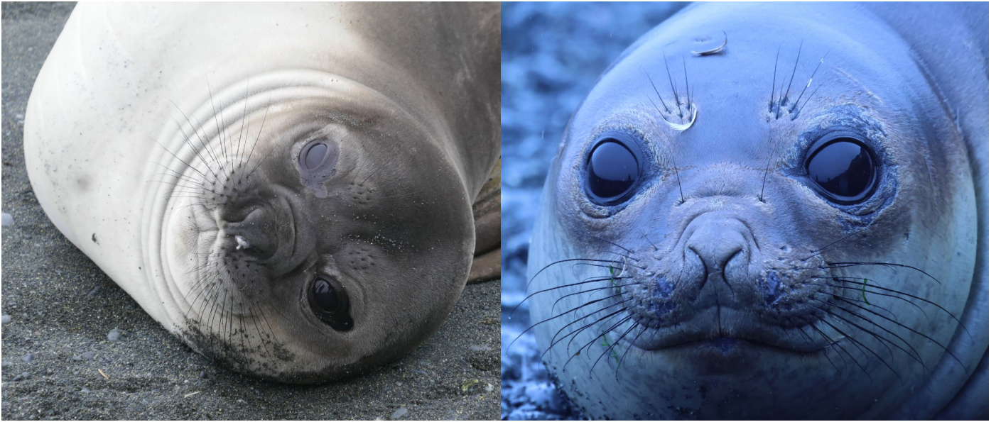
Above: Young male Elephant Seals gather on the sandy beach—belching, farting and fighting like most adolescent males!