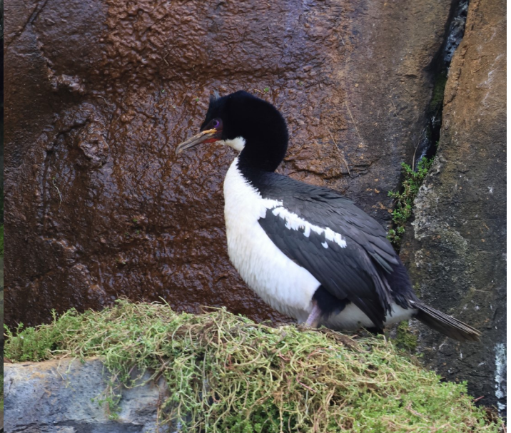
Left: Yellow-eyed Penguin , and above: Auckland Island Shag .

Locally, we have several species of Cormorants , but each of the Sub-Antarctic Islands have unique Shags endemic to each of the islands. The Auckland Island Shag is one of these birds which all have distinctive facial markings.